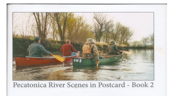
Pecatonica River Scenes in Postcard - Book 2

Freeport Park District 1122 S. Burchard Ave. Freeport, IL 61032 1-815-235-6114 www.freeportparkdistrict.org Lena Community Park District 609 N. Schuler St. Lena, IL 61048 1-815-369-5351 www.lenaparks.org