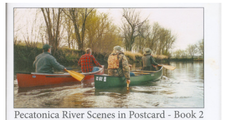
Pecatonica River Scenes in Postcard - Book 2

Lena Community Park District 609 N. Schuler St. Lena, IL 61048 1-815-369-5351 www.lenaparks.org