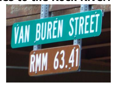
Sponsor - State Bank

Van Buren Street Iron Bridge – Freeport It is 26.41 miles to the Winnebago / Stephenson County Line. It is 63.41 miles to the Rock River.