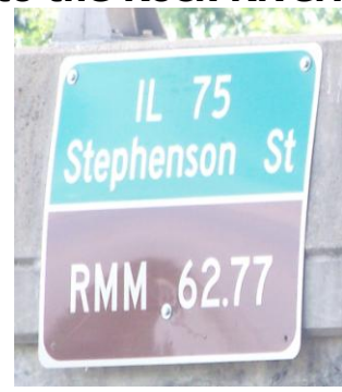
Sponsor - IDOT

Stephenson Street Concrete Bridge It is 25.77 miles to the Winnebago / Stephenson County Line. It is 62.77 miles to the Rock River.