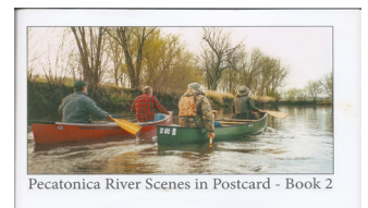
Pecatonica River Scenes in Postcard - Book 2

www.freeportparkdistrict.org Lena Community Park District 609 N. Schuler St. Lena, IL 61048 1-815-369-5351 www.lenaparks.org