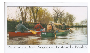
Pecatonica River Scenes in Postcard - Book 2

Lena Community Park District 609 N. Schuler St. Lena, IL 61048 1-815-369-5351 www.lenaparks.org